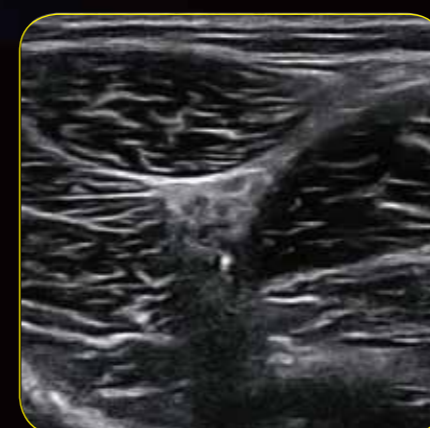
Sciatic Nerve Pop